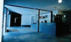
The open interior view of the interior shows the view of the building to the public with light entering from the interior with ceiling and glass panels at the end of the gallery