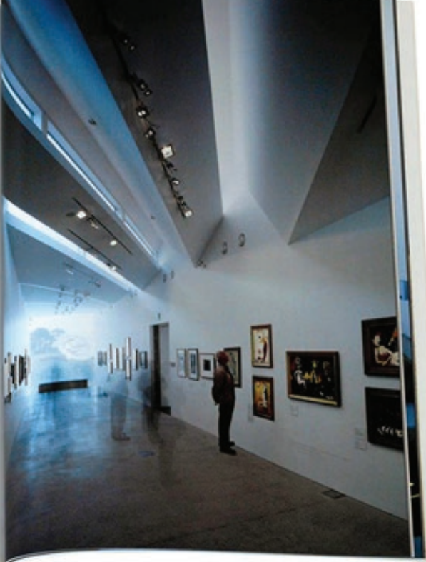
SEE THE ARCHITECTURE OF THE BUILDING FROM THE INTERIOR WITH THE LIGHT ENTERING FROM THE INTERIOR WITH THE CEILING AND GLASS PANELS AT THE END OF THE GALLERY